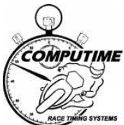
Clerk of Course - Chris Cameron